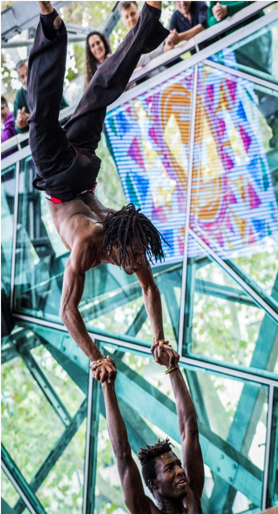
Young performers showcasing their skills at the 2014 Ubuntu Youth Stage