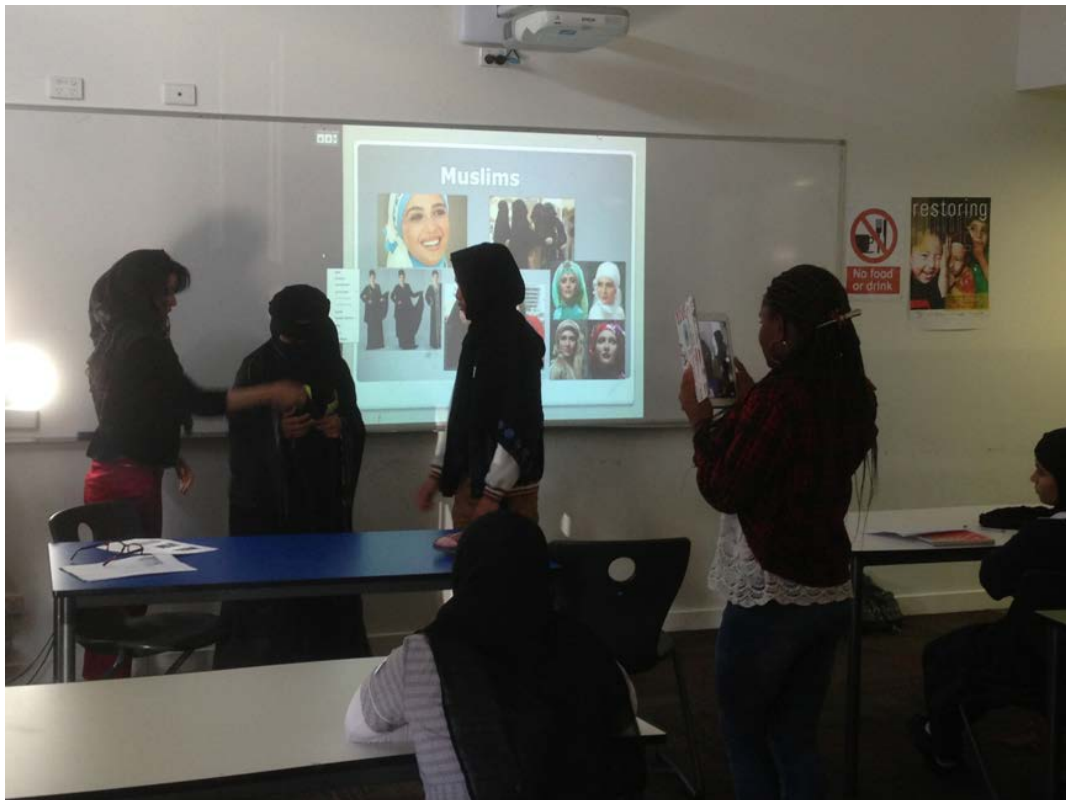
MMYN members presenting in Geelong and showing participants the different styles of wearing Muslim coverings for women (March 2014)

of religion and cultures in Victoria. Through interactive activities, the MMYN presenters explored ideas around diversity and identity, as well as sharing personal experiences about being a young person in Victoria.