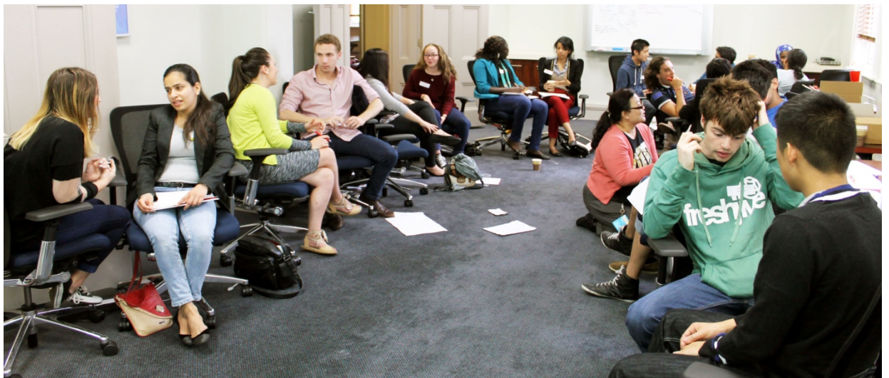
MMYN members learning about interfaith dialogue (February 2014)