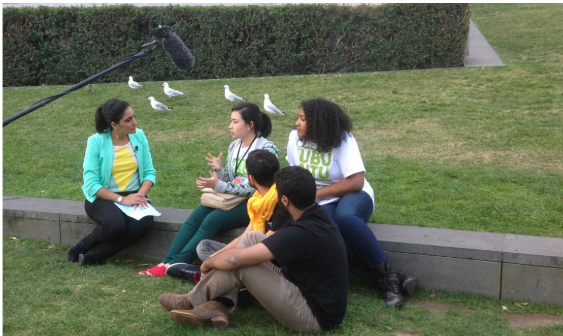
MMYN Members talking with the ABC's Australia Network about multiculturalism in Victoria (March 2014)

With the continuous support of Office of Multicultural Affairs and Citizenship (OMAC), the MMYN will continue to bridge the gap between the Government and Victoria's multicultural and multifaith young people. The MMYN will continue to advocate on priority issues identified by its members and other young Victorians, and work to increase understanding between Victorians from different faiths and cultures.