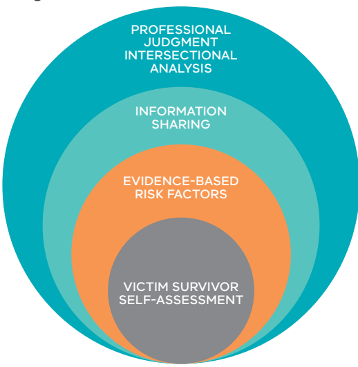
Figure 1: Model of Structured Professional Judgement

Review guidance in Responsibility 6 about sharing information with other services or professionals, including the relevant consent thresholds when sharing information about the perpetrator or the victim survivor. Identify key professionals and services who you may seek to engage in coordinated and collaborative risk assessment and management through consideration of the protective factors and the perpetrator circumstances. Consider using the genogram or ecomap exercises outlined in Responsibilities 7 and 8 to assist in this process.