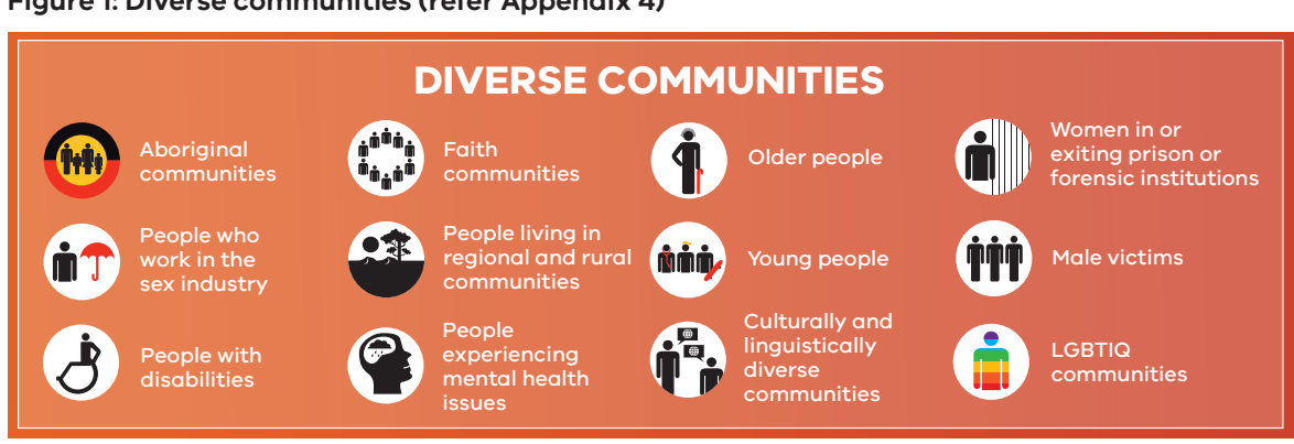
Figure 1: Diverse communities (refer Appendix 4)

A text description of the diagram is at Appendix 4.