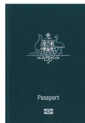
Australian or foreign passport