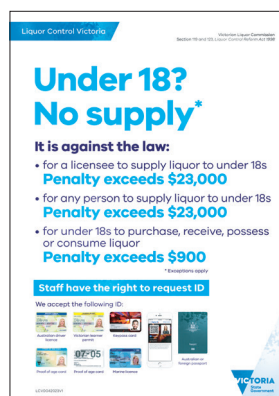
Incorrect Must be clearly printed without blurring or patches