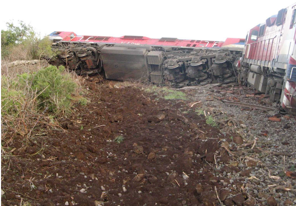
Figure 4 – The path of the derailed lead locomotive (N452)

The derailed passenger cars sustained minor wheel and bogie damage as well as some minimal damage to underslung equipment.