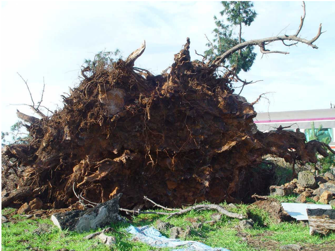
Figure 6 – Uprooted tree