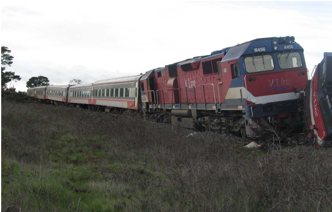
Figure 3 – The second locomotive (N456) and passenger cars remained upright