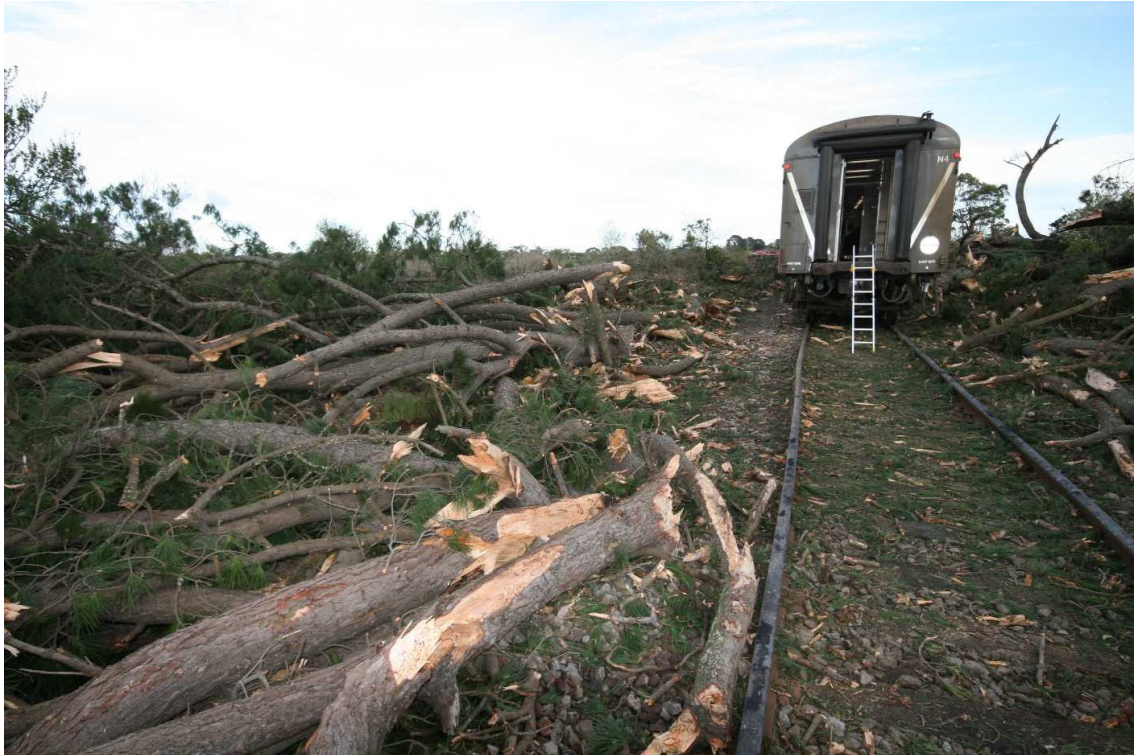
Figure 5 – Fallen tree coverage across track

The track structure between Geelong and Warrnambool is single-line broad-gauge (1600 mm), Class 2 track 5 . The line is owned by the Victorian Government business enterprise VicTrack and is leased to V/Line Passenger Corporation which is responsible for track maintenance. Between Winchelsea and Warrnambool (which includes the incident location) the line is worked under the Train Order 6 system of safeworking control.