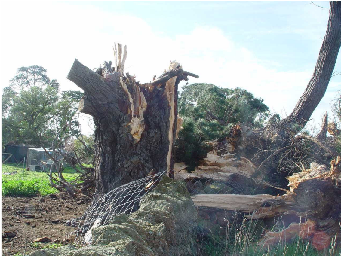
Figure 7 – Break in trunk of tree (note also its proximity to rock wall)