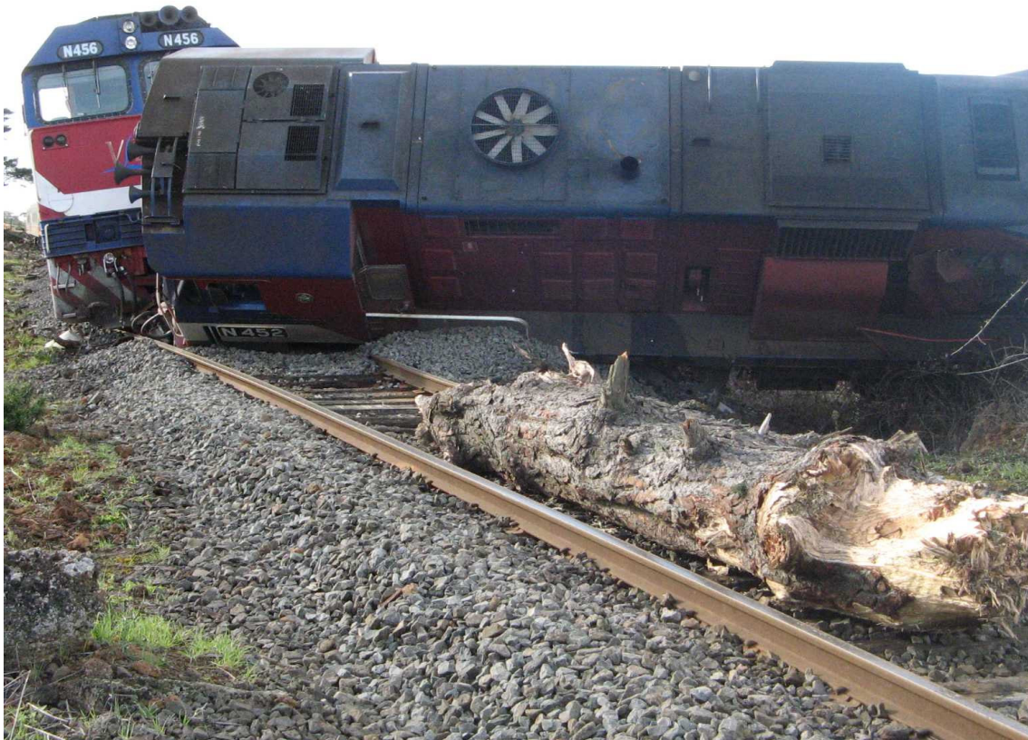
Figure 9 – Photo showing displaced log ahead of derailed train