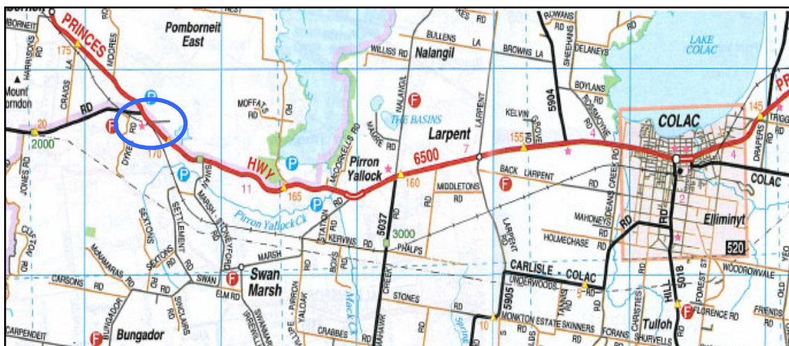
Figure 2 – Locality map

The train collided with two trees which had been felled by high winds, and the derailed locomotive diverged completely from the permanent way and rolled almost onto its side. The rest of the train remained within the confines of the permanent way with all but the last passenger car derailed.