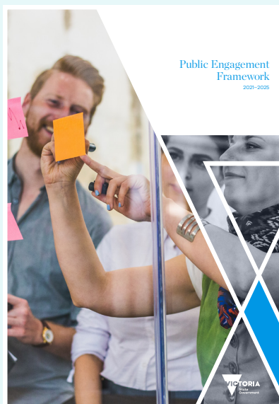
Victorian Government Public Engagement Framework 2021-2025 , Department of Premier and Cabinet, November 2021