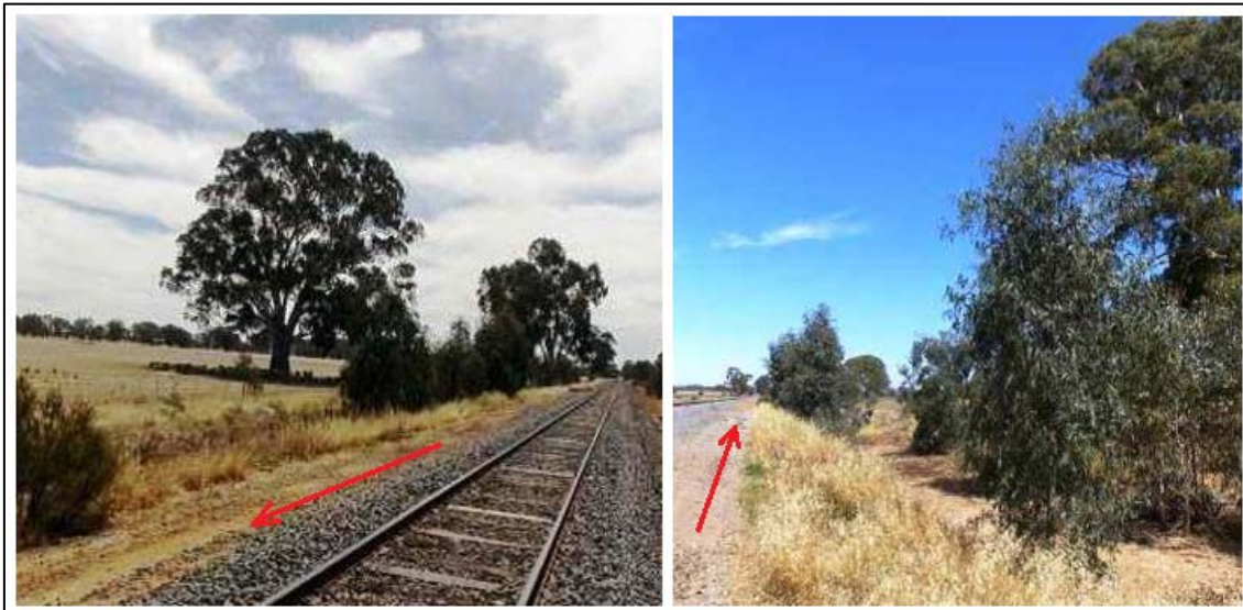
Figure 5: Lineside tree growth. Arrows show direction of train