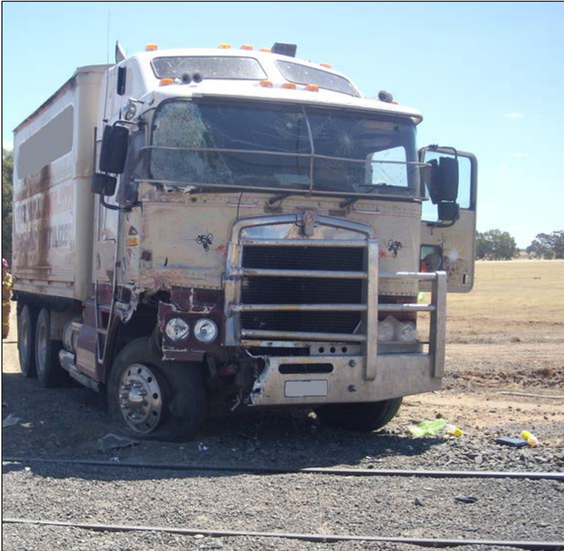
Figure 2: The truck immediately after the collision