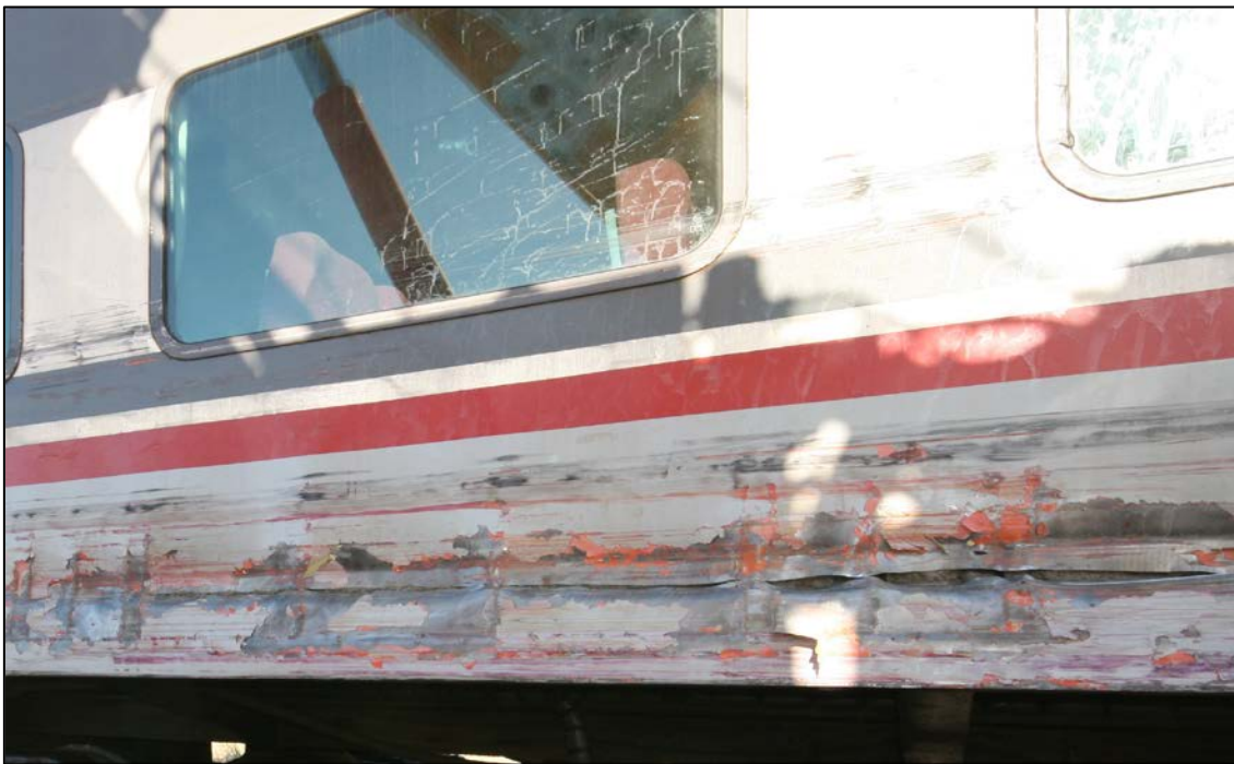
Figure 4: Detail of intrusion into passenger car side panel – first car