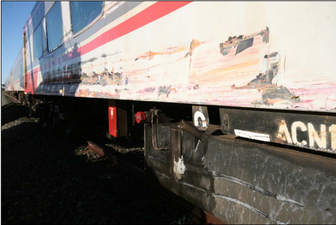
Figure 3: Damage sustained by the first car at the initial impact point