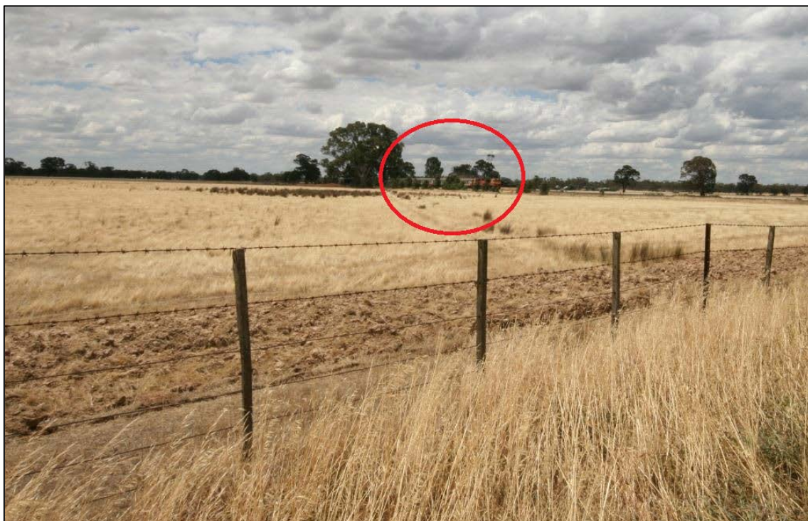
Figure 9: View of approaching train from the road 100 m back from the level crossing. Train is approximately 200 m from the crossing