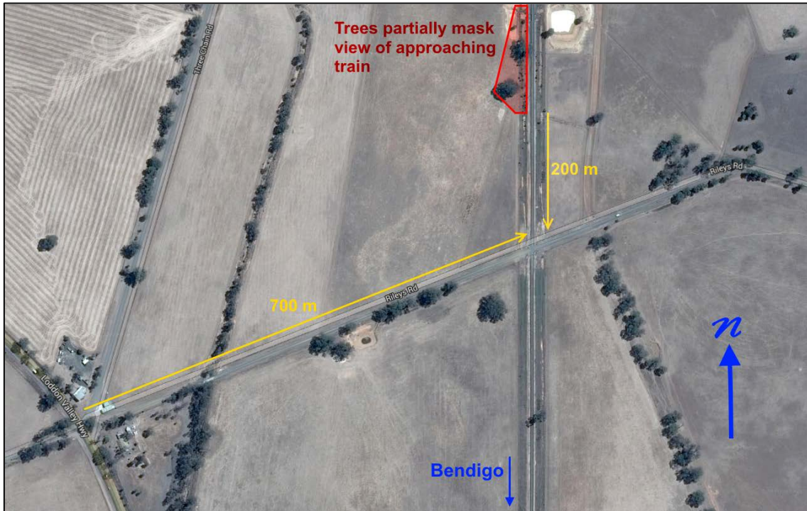
Figure 6: Aerial view of location - Rileys Road level crossing