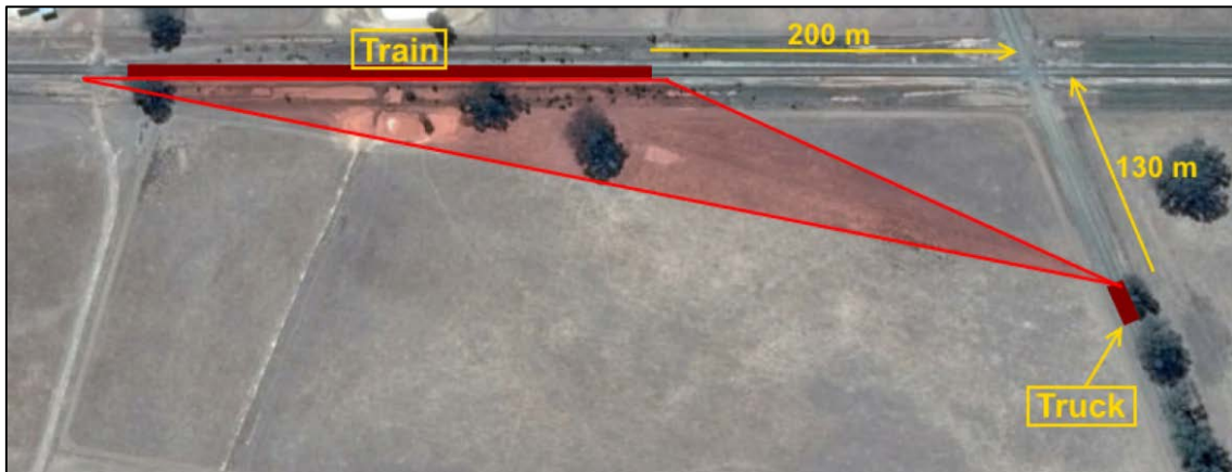
Figure 8: Vehicle driver's field of view, through foliage, of the approaching train