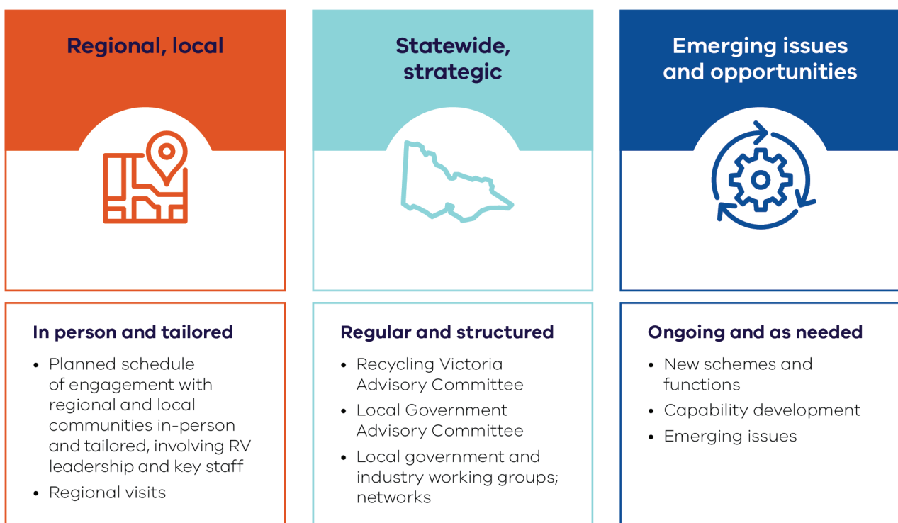
Figure 2 Community Engagement Strategy approach.

Recycling Victoria will work with Victoria's Traditional Owners and ensure our work is founded on the principles of self-determination. We will make sure that Traditional Owner cultural knowledge is part of how we deliver our functions.