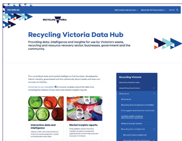
Figure 3 Community Engagement Strategy approach.

Our decisions and actions will be informed by market data and intelligence.