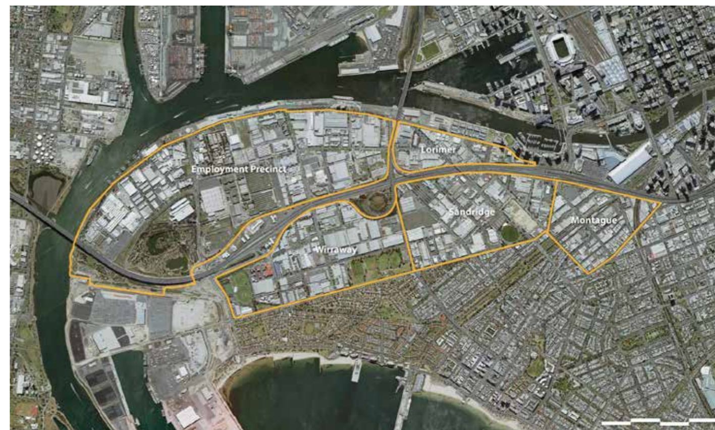
Figure 1: Fishermans Bend Aerial, Study Area Boundary