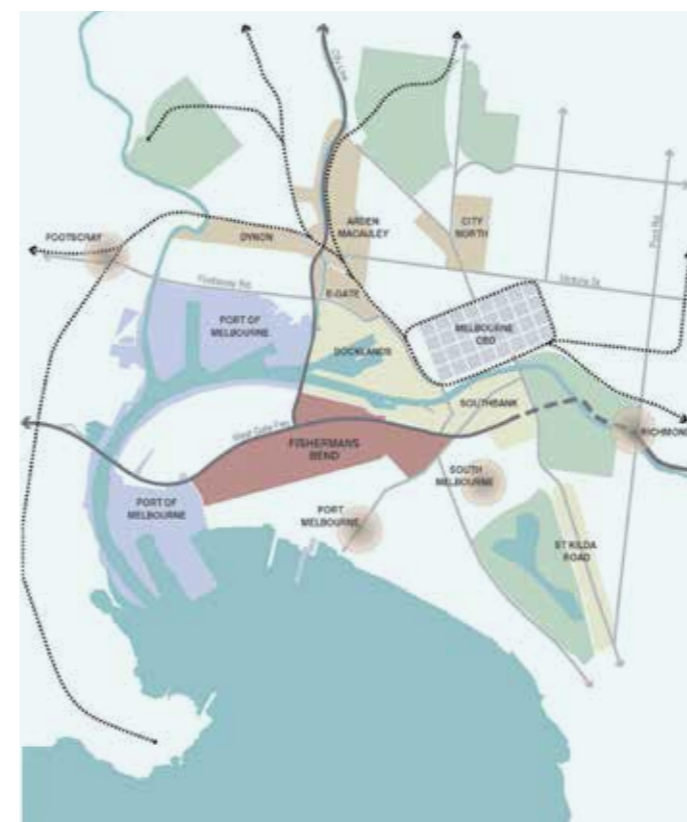
Figure 2: Fishermans Bend in the urban renewal context