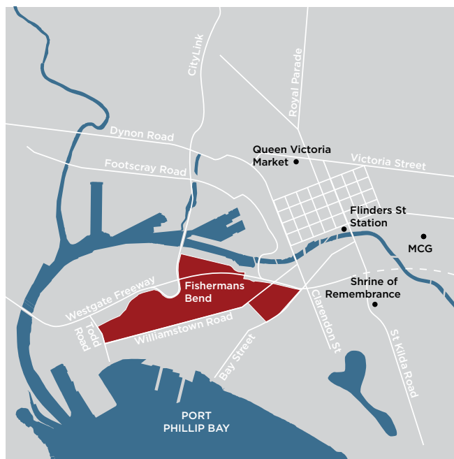
Figure 1: Fishermans Bend Urban Renewal Area location plan

We invite you to participate and share your views on this city-shaping project.