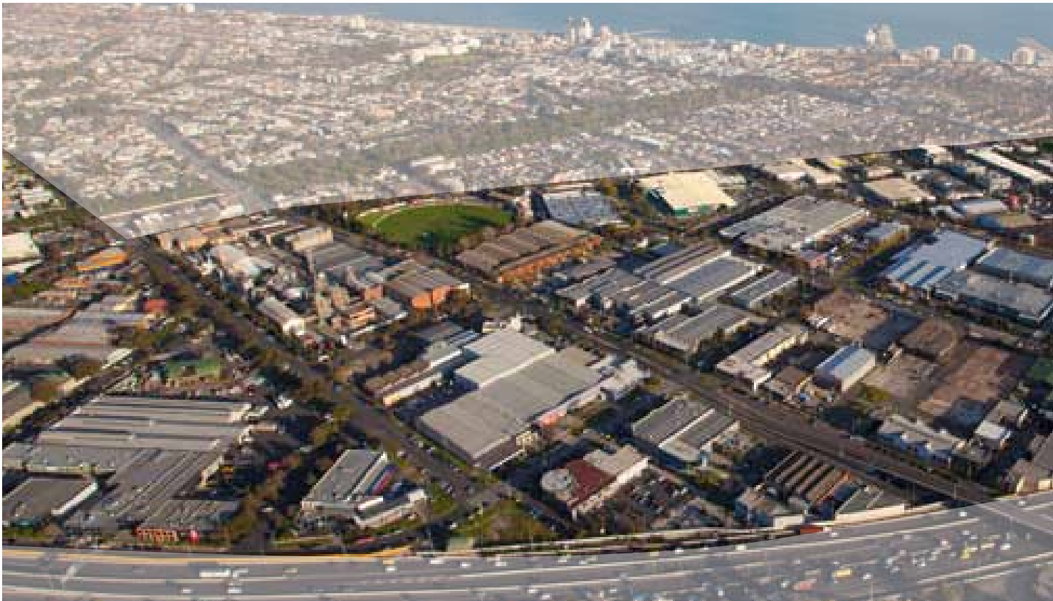
Figure 5: Aerial photograph of Fishermans Bend Urban Renewal Area today looking towards Port Melbourne and Beacons Cove

By transforming approximately 250 hectares of low intensity industrial land into a thriving network of urban villages between the CBD and the bay, the Fishermans Bend Urban Renewal Area will be one of Australia's largest urban renewal projects and play a vital role in consolidating Melbourne's position as the world's most liveable city.