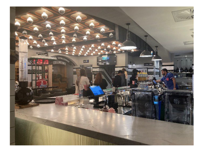
Figures 5 and 6: Examples of interior of Strike Bowling