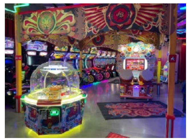
Figures 3 and 4: Examples of interior of Archie Bros