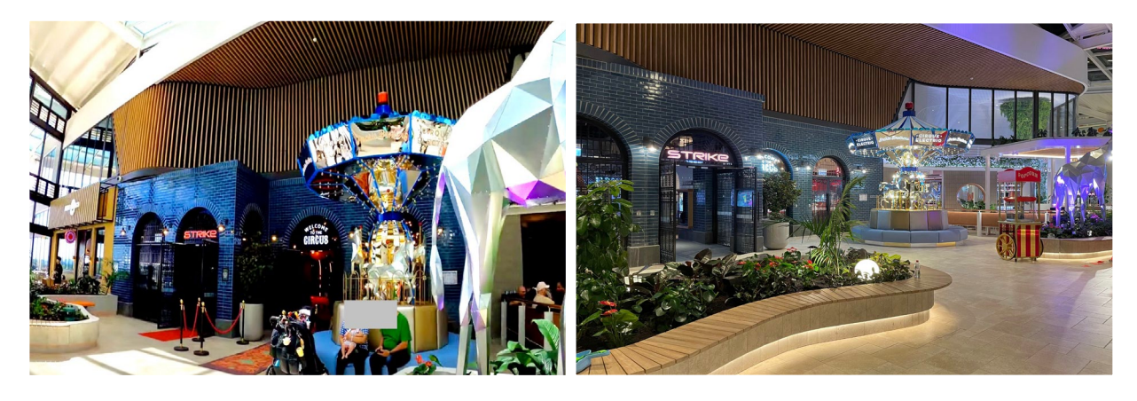
Figure 1: Entry to Archie Bros and Strike Bowling

8. Strike Bowling's main entrance is located directly adjacent to the entry of Archie Bros, creating a contiguous flow between the two sections. In addition to its own dedicated staircase entrance, Strike Bowling may also be accessible through Archie Bros via an internal pathway that connects the sections.