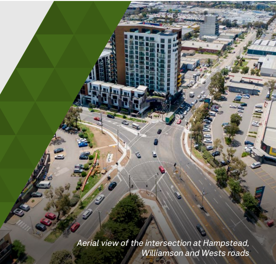
Aerial view of the intersection at Hampstead, Williamson and Wests roads