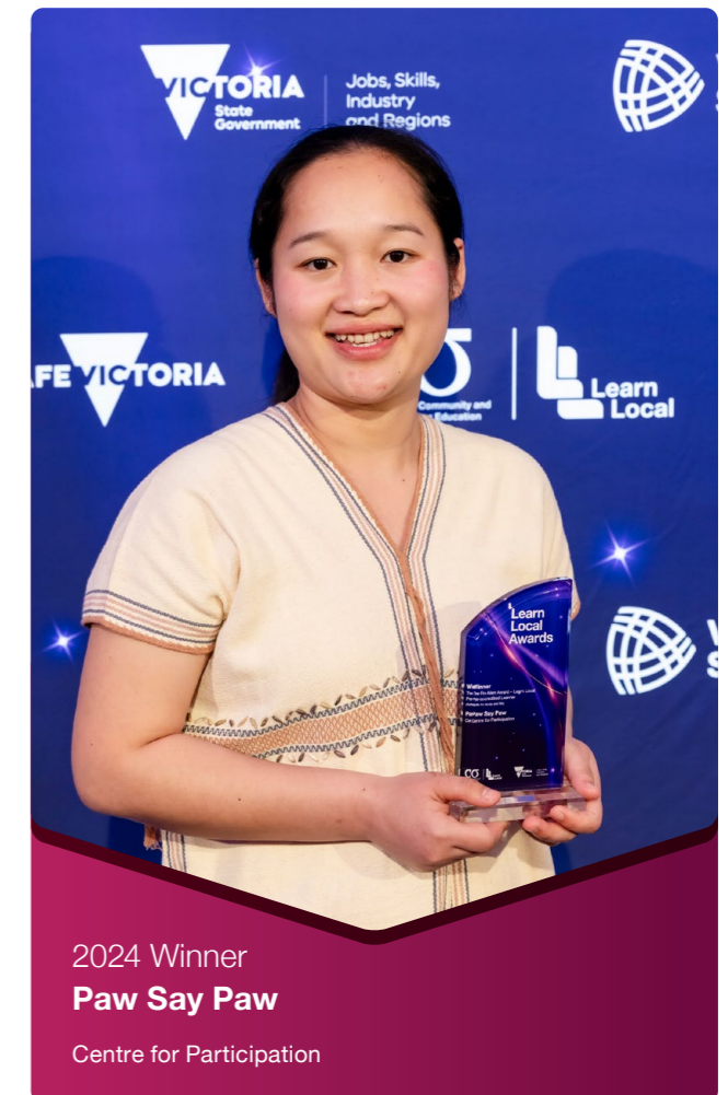
2024 Winner Paw Say Paw

If the course(s) you are studying focuses on developing skills needed for work, check out the Pre-accredited Learner (Skills for work) Award' (see page 14).